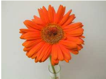
do not reject