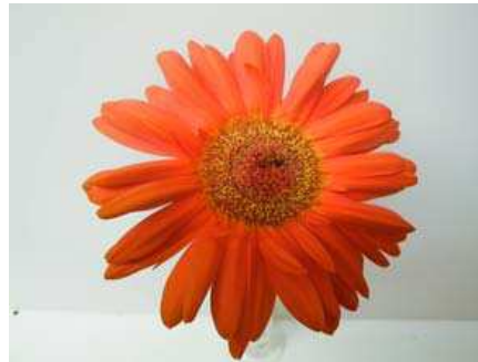
reject from this point