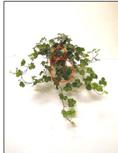
Decorative value 3