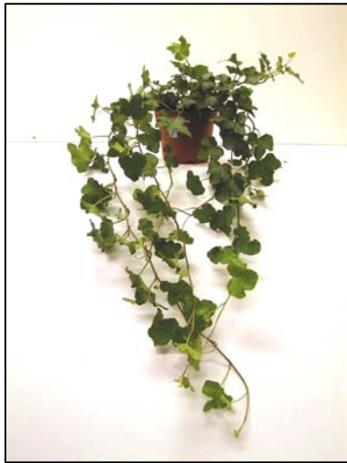
Decorative value 5