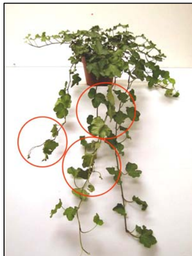
Decorative value 2